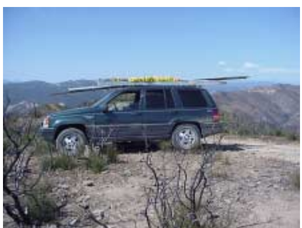
AD6E arrival at Yolo ridge top