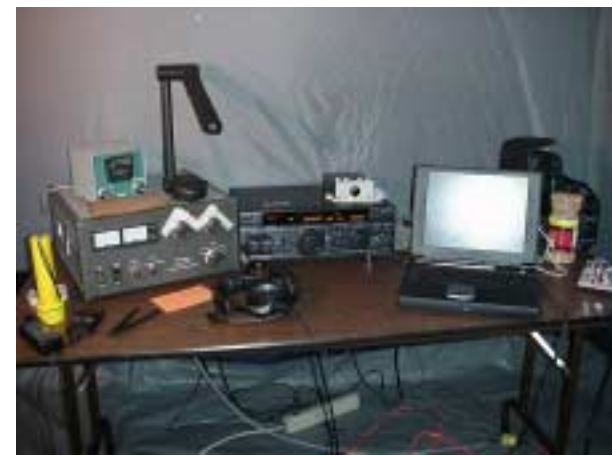
AD6E operating table